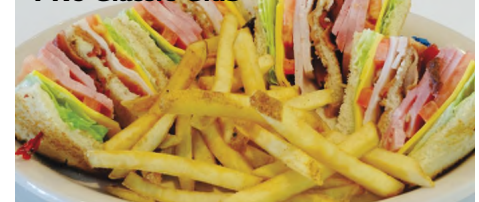
PR's Classic Club