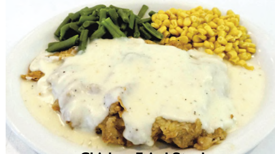
Chicken Fried Steak

With Fries and Salad or a choice of 2 vegetables from daily list