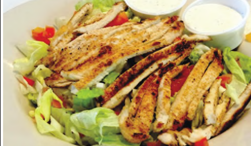
Chicken Cobb Salad