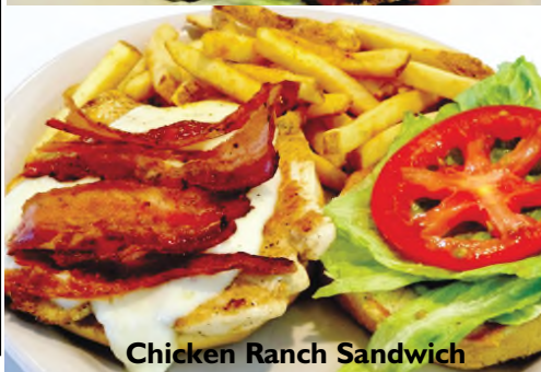
Chicken Ranch Sandwich