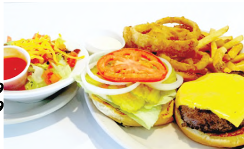
Texas Cheeseburger Special