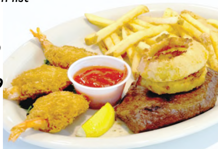
Sirloin & Shrimp